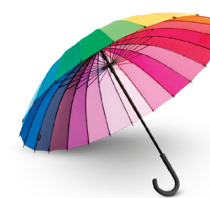
Color Wheel Umbrella $50; burkedecor.com