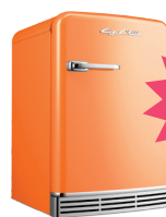
Retro Mini Fridge $1,595; bigchill.com