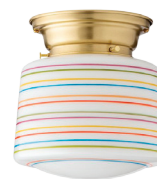
Stripe Drum Shade $88; schoolhouse.com

The Guinness World Record for the longest-lasting rainbow on record (8 hours, 58 minutes) goes to a rainbow in Taiwan in 2017.