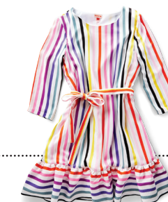
Poppy Dress $298; persifor.com