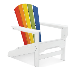
Adirondack Chair $310; wayfair.com