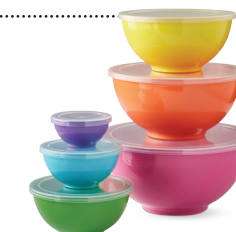
Melamine Mixing Bowls $60 for 6; williams-sonoma.com