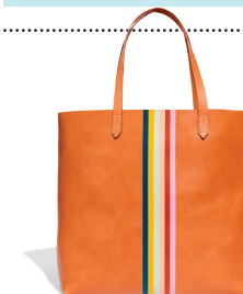
Transport Tote $178; madewell.com

The song "Somewhere Over the Rainbow" was originally cut from The Wizard of Oz .