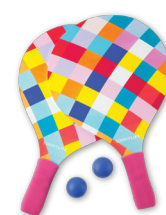
Beach Paddles $30; sunnylife.com