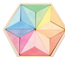
Spectrum Chalk Set $30; fredericksandmae.com