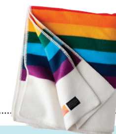
Wool Pendleton Blanket $259; urbanoutfitters.com