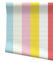
Stripe Wallpaper $188 per double roll; katiekime.com