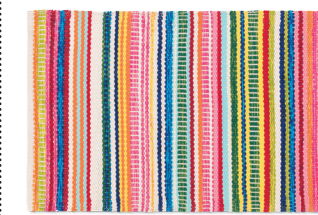
Indoor/Outdoor Rug $50 for 2'-by-3'; annieselke.com