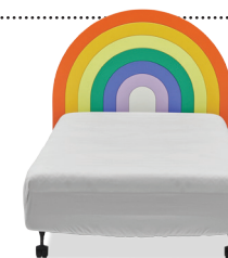
Wood Headboard $122 for a twin; walmart.com