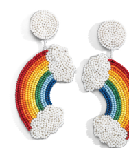
Beaded Drop Earrings $26; mulberry-grand.com