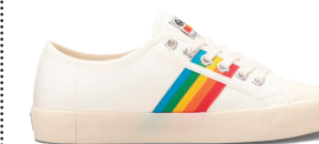
Rainbow Sneakers $65; zappos.com